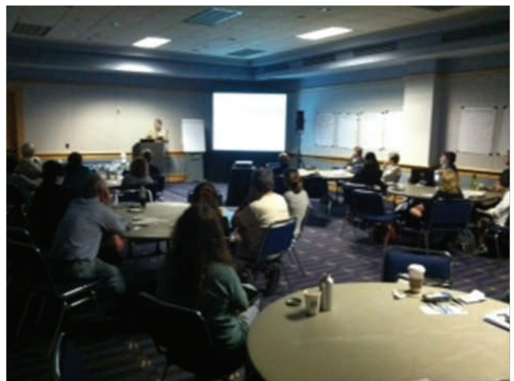
Figure 2 - Workshop presentations in the morning sessions providing needed background for afternoon discussions.

After a short coffee break, Jay Barlow and Barb Taylor summarized what we know of the current status of the vaquita population, including results of the 2008 line transect survey that suggests that only about 200 vaquitas remain, and that they have been declining at about 8% per year since the late 1990s (2, 3). Lorenzo