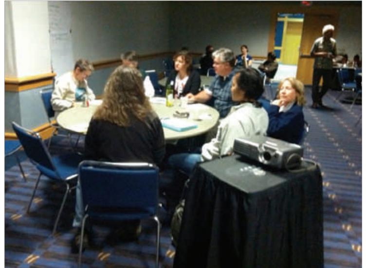
Figure 3 - Workshop participants discussing the future of the vaquita, and making recommendations on how conservation efforts can proceed more effectively.

summary of promising efforts to develop an acoustic monitoring system for establishing population trends (9). Finally, Tom Jefferson gave a short history of US-based vaquita conservation efforts, and described the recent work of ¡VIVA Vaquita! (5,6). These presentations and discussions set the stage for the working groups as follows (Figure 3).