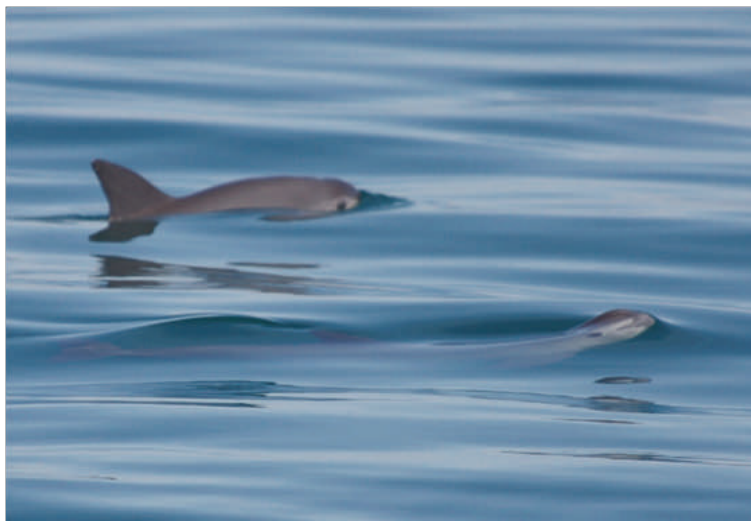
Figure 6 - Two vaquitas surfacing next to a vessel in the northern Gulf of California, October 2008. Photo taken by Thomas A. Jefferson under permit (Oficio No. DR/488/08) from the Secretaria de Medio Ambiente y Recursos Naturales (SEMARNAT), within a natural protected area subject to special management and decreed as such by the Mexican Government.

Seasonal distribution. Some data on seasonal movements and distribution of vaquitas should come from the C-PODs mounted on the Vaquita Refuge boundary buoys. Sadly, however, coverage will be sparse. Also, it is anticipated that no data will be obtained from areas outside the Refuge. The lack of such data makes it difficult to consider season/area closures as a means of managing fisheries.