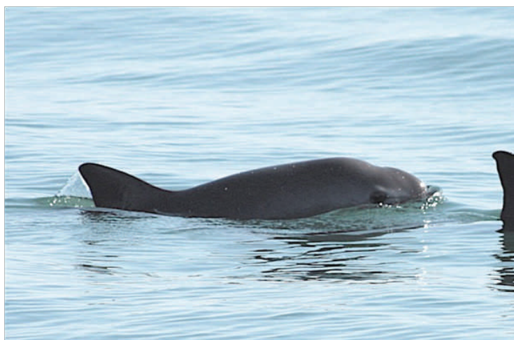
Figure 1 - A rare photograph of a live vaquita at sea. under permit (Oficio No. DR/488/08) from the Secretaria de Medio Ambiente y Recursos Naturales (SEMARNAT), within a natural protected area subject to special management and decreed as such by the Mexican Government.

The ideas presented in this report represent a mix of thoughts from many different people and many were not supported by all those who attended the workshop. The text of this report is simply a summary of what was discussed and the report should not be seen as reflecting the views or opinions of any particular person or organization, including ¡VIVA Vaquita!