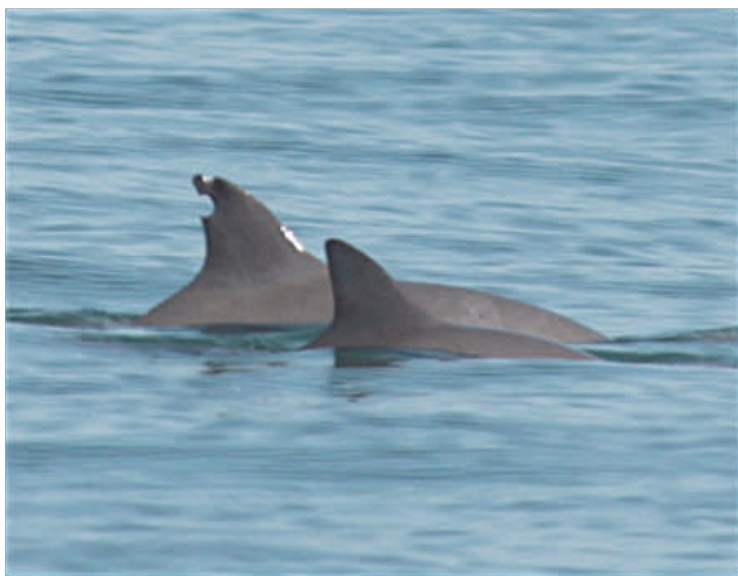
Figure 5 - Dorsal fins of two vaquitas. Their similar appearance makes individual identification difficult. However, if there are unique marks or damaged dorsal fins, individual identification has been shown to be possible with this species.

Life history. Because so few carcasses become available, little progress has been made recently in estimating birth or death rates, age at first reproduction, or calving interval. Photographic identification of individual vaquitas (Figures 5, 6) may make it possible to improve estimates of these and other life history parameters somewhat, but participants recognized that it would take a great deal of field effort to obtain sufficiently large samples (6).